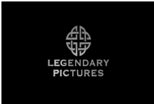
Legendary Pictures logo

creating a subsidiary in China to make films geared particularly to the pan-Asian audience. Thus, while Legendary is an example of Wall Street's increased presence in financing Hollywood films, it is also a unique entity because of its expansion beyond just economic partnerships with a particular studio. Indeed, Legendary is starting to shift from functioning like an independent arm of a major media conglomerate to a more integrated and competitive independent studio on its own.