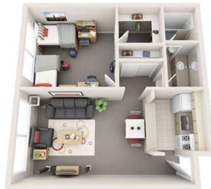
TROY HALL TYPICAL 1BEDROOM APT PLAN