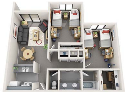
TROY EAST TYPICAL 2 BEDROOM APT PLAN