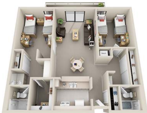
TROY HALL TYPICAL 2 BEDROOM APT PLAN