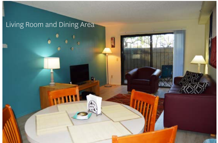
Living Room and Dining Area

* Information, including rents, is accurate as of the time of publication. The availability of listed housing accommodations and programs are subject to change based on local health authority restrictions and guidelines.