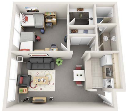
TROY EAST TYPICAL 1 BEDROOM APT PLAN

More information, including links to all the services offered by USC Auxiliary Services can be found on our website at housing.usc.edu