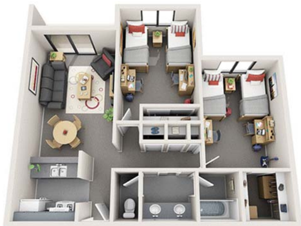
TROY EAST TYPICAL 2 BEDROOM APT PLAN