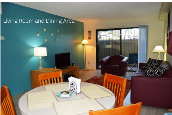
Living Room and Dining Area