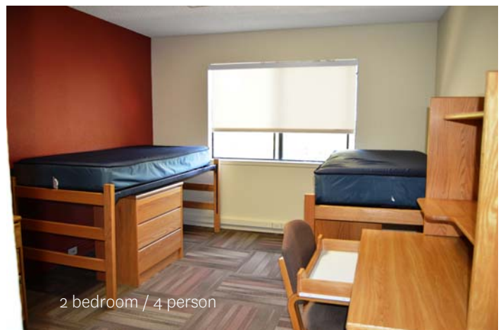
2 bedroom / 4 person